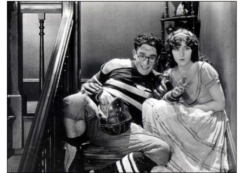
The Freshman (1925) starring Harold Lloyd and Jobyna Ralston